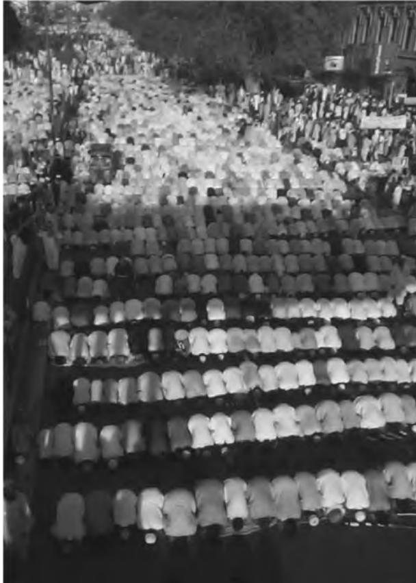
A demonstration in support of the Afghan Taleban, Karachi, 26 October 2001