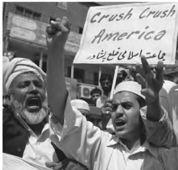
Jamaat Islami demonstrating in Peshawar against US drone attacks, 16 May 2008