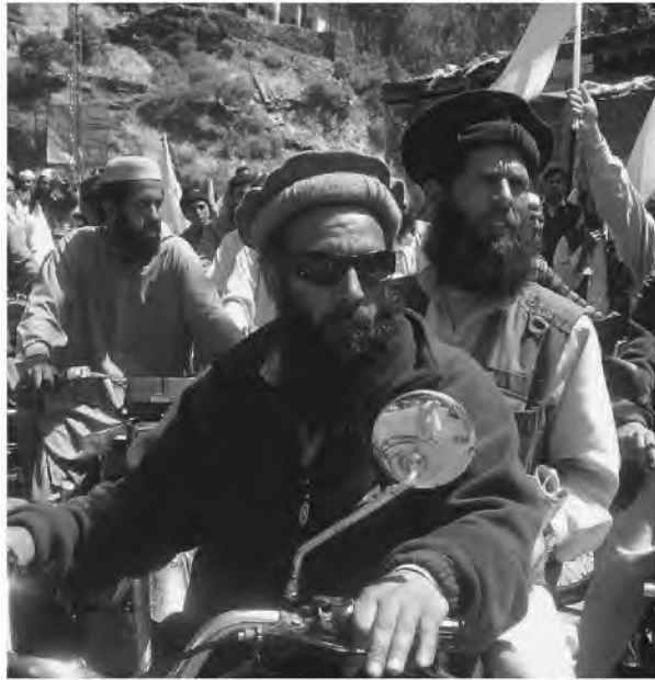
Pakistani Taleban supporters celebrate promulgation of the Nizam-e-Adl agreement, Swat, 16 April 2009