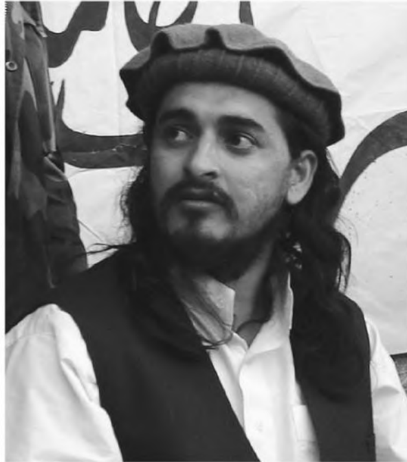
Hakimullah Mahsud, Amir (leader) of the Pakistani Taliban, Orakzai Tribal Agency, 9 February 2010