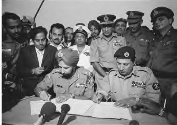
Surrender of the Pakistani forces in East Pakistan, Dhaka, 16 December 1971