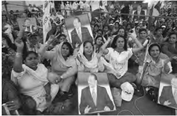
MQM women activists with pictures of Altaf Hussain (2007)