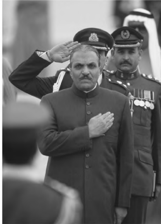
General Muhammad Zia-ul-Haq, military ruler 1977 – 88