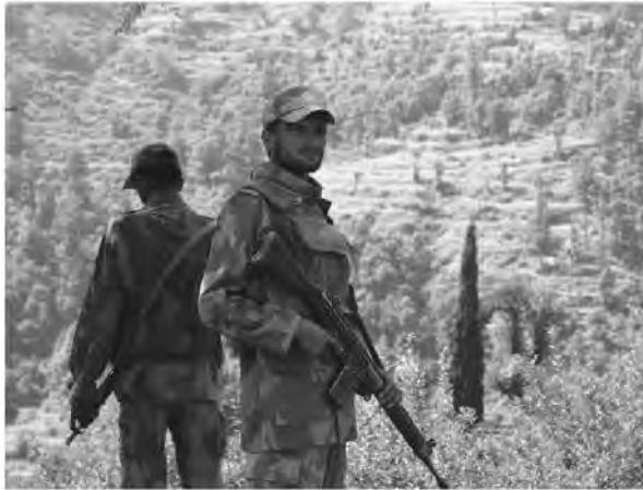
Pakistani soldiers on guard in Swat, September 2009