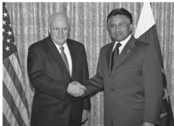
General Pervez Musharraf (right), military ruler 1999 – 2008, with US Vice-President Dick Cheney, Islamabad, 26 February 2007