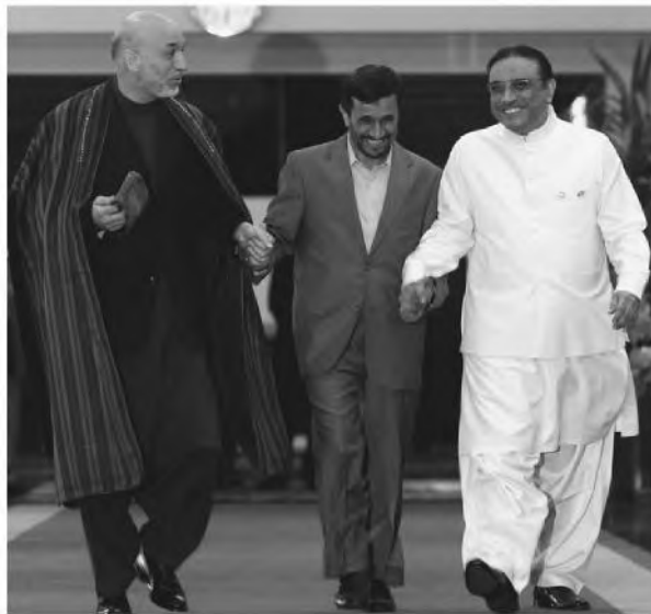
President Asif Ali Zardari with President Mahmoud Ahmedinejad (centre) of Iran and Hamid Karzai of Afghanistan (left), Tehran, 24 May 2009