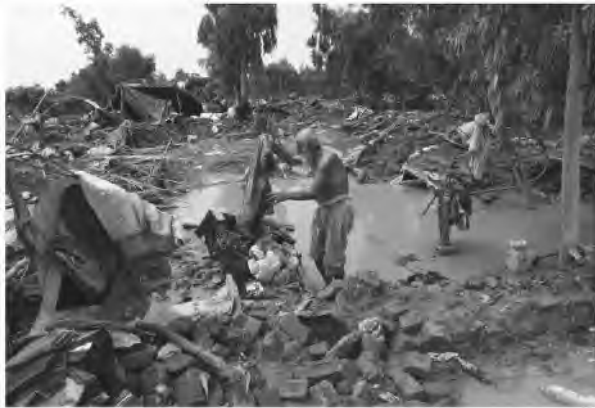
Destruction caused by the floods in Azalkhel, NWFP, 9 August 2010