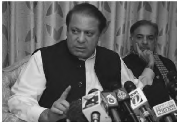
Nawaz Sharif (left) and Shahbaz Sharif (2008)