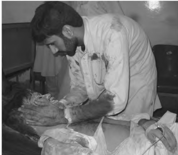
A victim of a suicide bombing, Kohat, 7 September 2010

The development of electoral politics from the 1880s led to political mobilization along religious lines. There were periodic explosions of communal violence, such as the riots in Rawalpindi in 1926 over the building of a cinema next to a mosque. However, British patronage, common agrarian interests and fear of communal violence meant that until the very last years of British rule, Punjab politics was dominated by the Unionist Party, which brought together Muslim, Hindu and Sikh landowners and their rural followers.