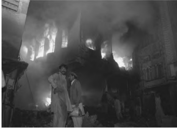
A terrorist attack in Peshawar, 5 December 2008