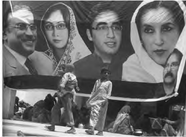
Poster of the Bhutto-Zardari family (2010)