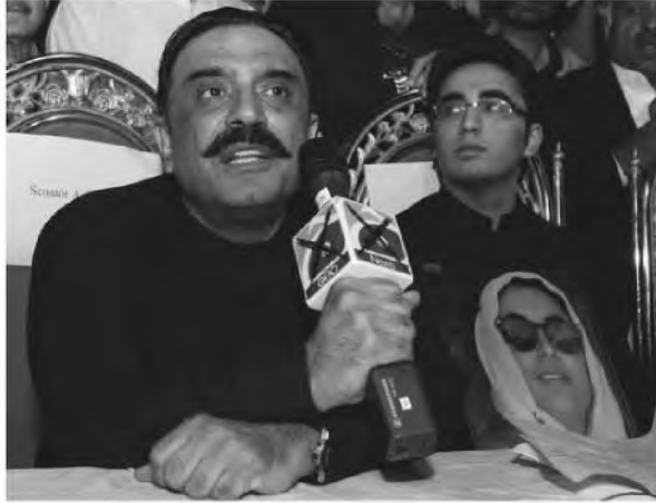
Asif Ali Zardari (left) and Bilawal Bhutto-Zardari, with the portrait of the late Benazir Bhutto (2007)