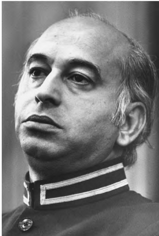
Zulfikar Ali Bhutto, Prime Minister 1971 - 77