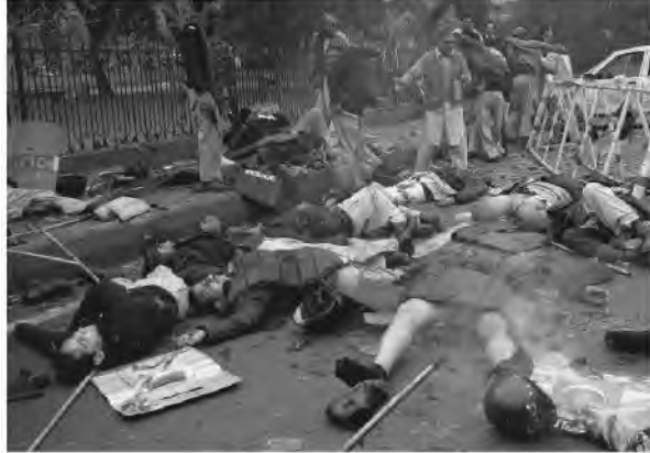
The aftermath of the suicide attack by the Pakistani Taleban on the Lahore High Court, 10 January 2008