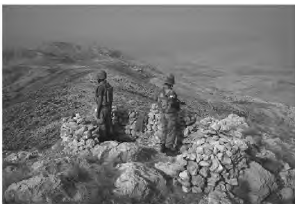
Pakistani soldiers in South Waziristan, October 2009