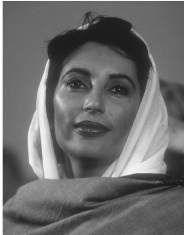
Benazir Bhutto (1989)