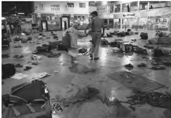
A terrorist attack by Lashkar-e-Taiba in Mumbai, India, November 2008: the aftermath of the attack on the railway station