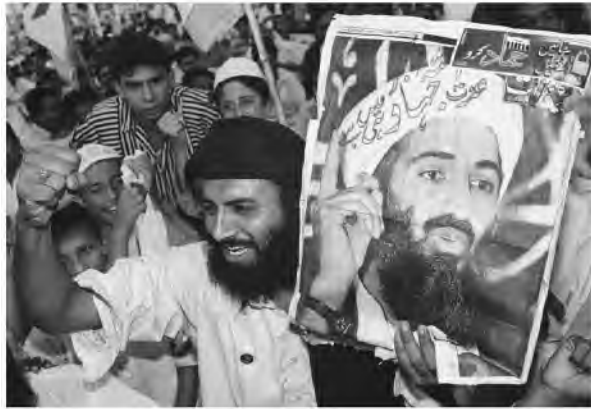
A demonstrator with a placard of Osama bin Laden, Karachi, 7 October 2001