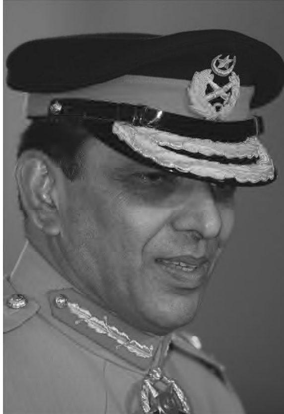
General Ashfaq Kayani, Chief of the Army Staff, November 2007