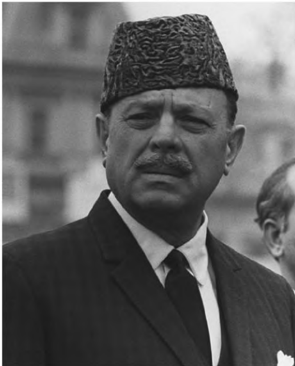
Field Marshal Mohammed Ayub Khan, military ruler