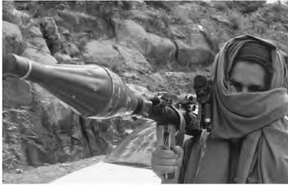
A Taleban patrol in Swat, April 2009