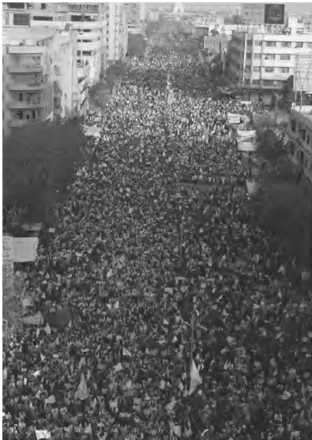
MQM Rally in Karachi (2007)