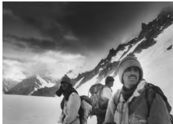
Pakistani soldiers on the Siachen Glacier, Kashmir, August 2002