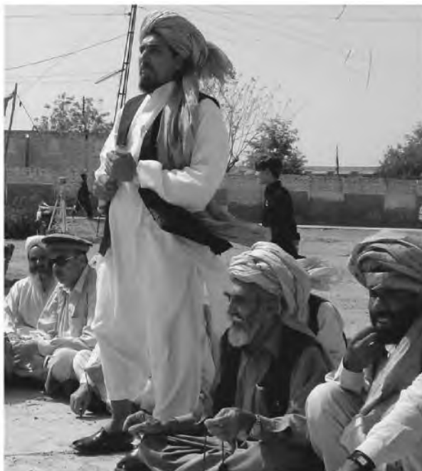
Mahsud tribesmen meet for a jirga to discuss US drone attacks, Tank, 20 April 2009